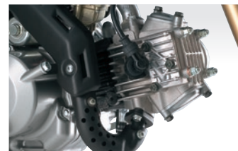
67cm 3 engine