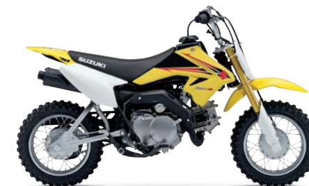
Champion Yellow No.2 (YU1)

Specifications, appearance, colors (including body color), equipment, materials and other aspects of the "SUZUKI" products shown in this catalogue are subject to change by Suzuki at any time without notice, and they may vary depending on local conditions or requirements. Some models are not available in some regions. Each model may be discontinued without notice. Please inquire at your local dealer for details of any such changes.