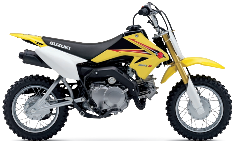
Champion Yellow No.2 (YU1)